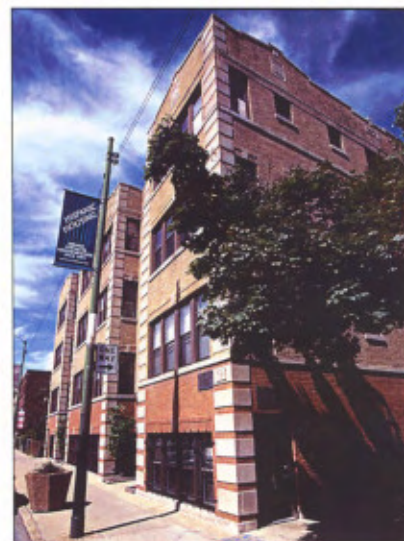
Diversey Square is a complex of six buildings with 196 multi-family units.