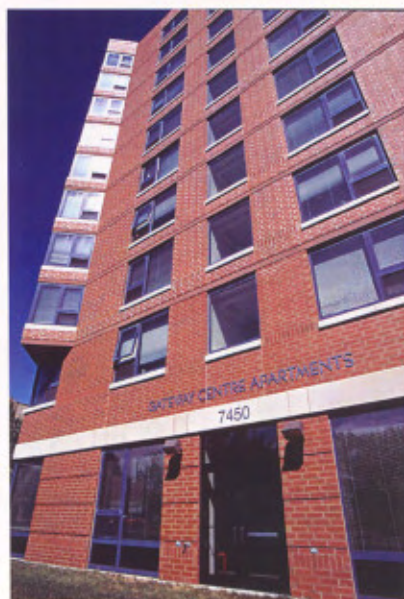
Completed in 2002, Gateway Apartments has 120 units.

2004 For sale single family residences: 30