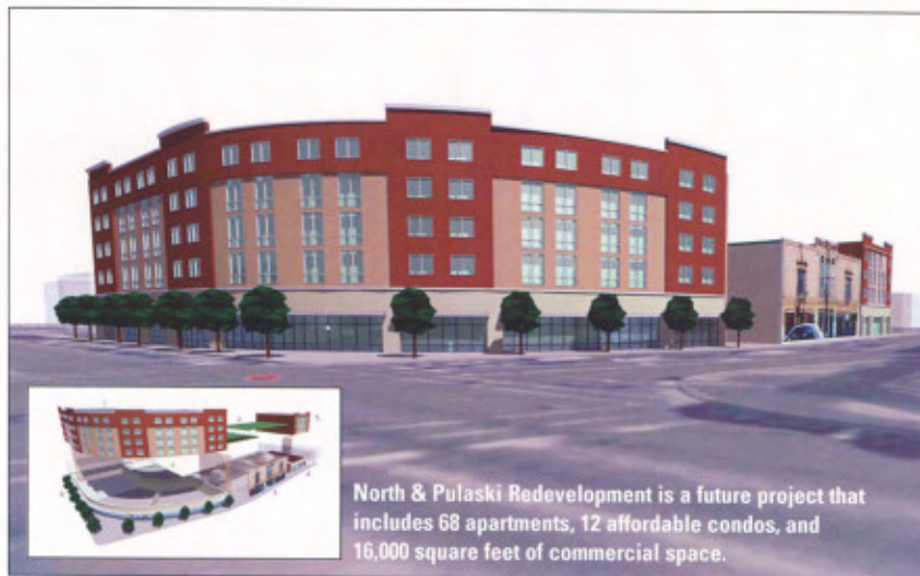
North & Pulaski Redevelopment is a future project that includes 68 apartments, 12 affordable condos, and 16,000 square feet of commercial space.